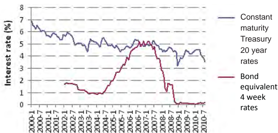
Figure 1: Long- and Short-Term Treasury Interest Rates, 2000-2010

Data source: US Treasury web page, read 9/8/2010.