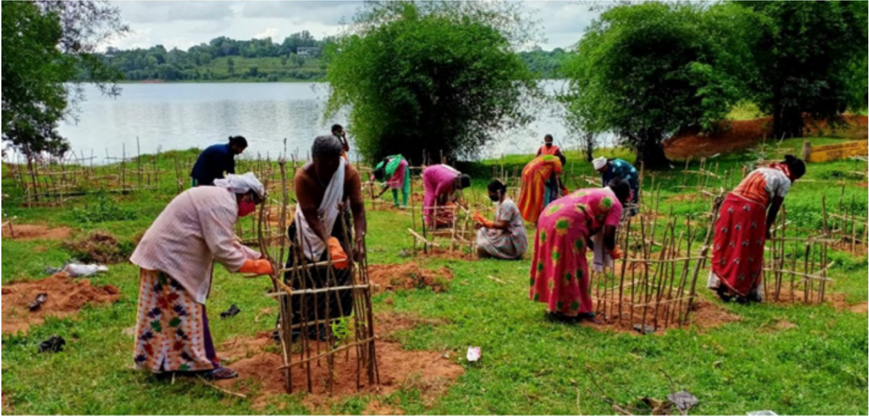
Figure 1. Kerala State MGNREGS Mission work