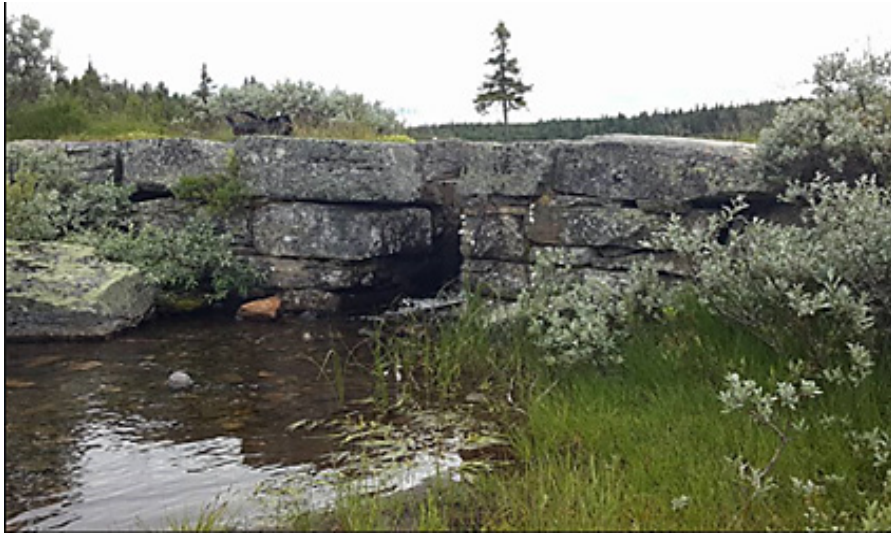
The old stone masonry dam from 1870 at Lake Svintjønnå before revitalization.