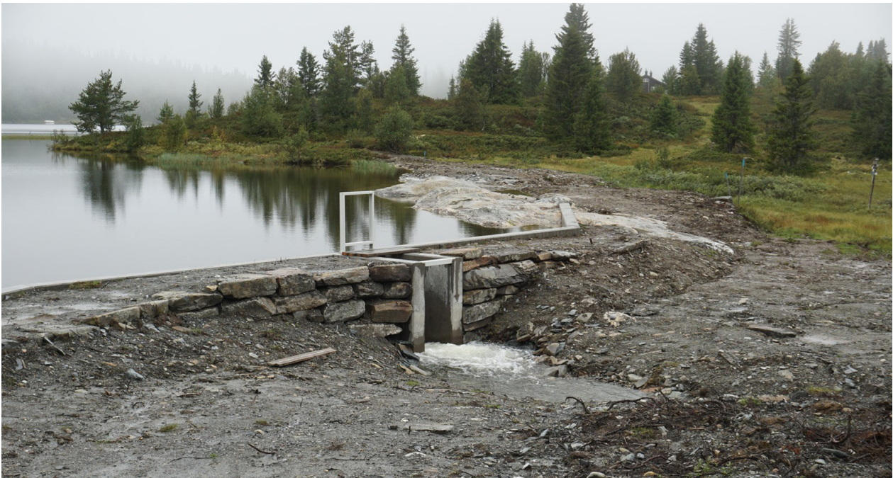
The old stone masonry dam after modifications completed, the measures increased the dam height by 0.5 meter and established a new gate and threshold, with automatic monitoring of the lake level.