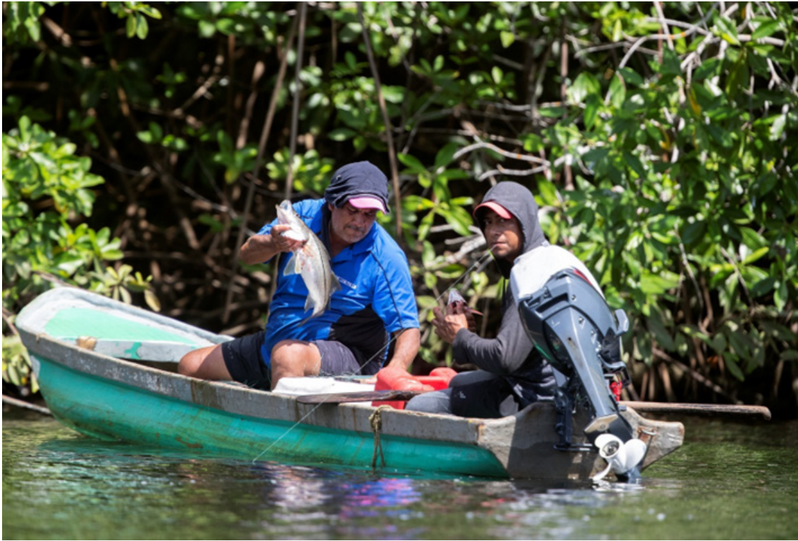
Local fishermen in the mangroves of the La Encrucijada Biosphere Reserve.