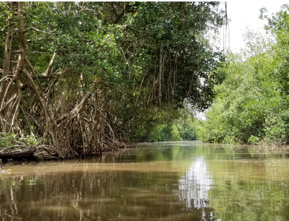
Mangroves in the La Encrucijada Biosphere Reserve.